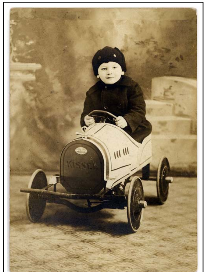
A studio photo of a child in a Kissel pedal car.

* 1929 Kissel 8-95 Tourster (car# 95-1504)