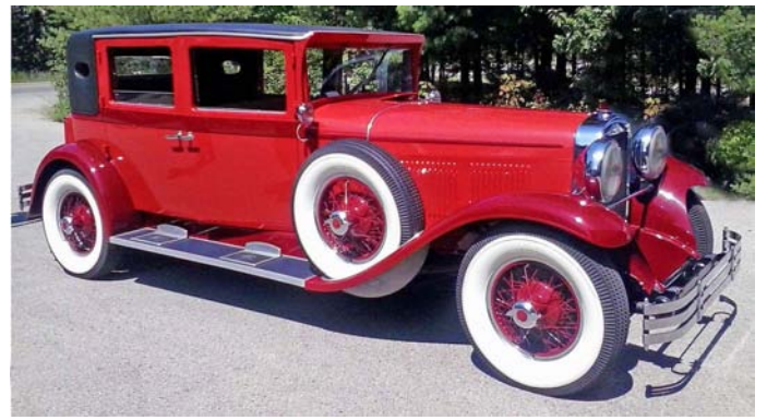
1929 Brougham (car# 126-1064)