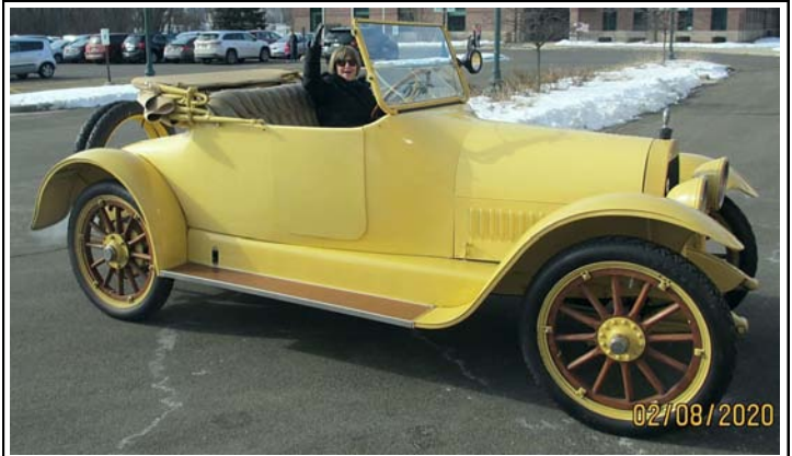
1918 Roadster (car# 38-5127)