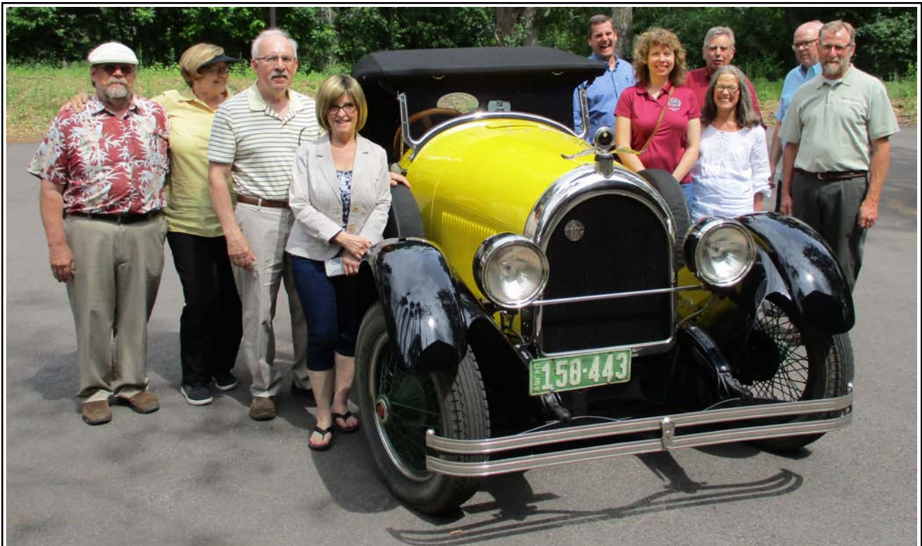
1924 Speedster (car# 55-4323)