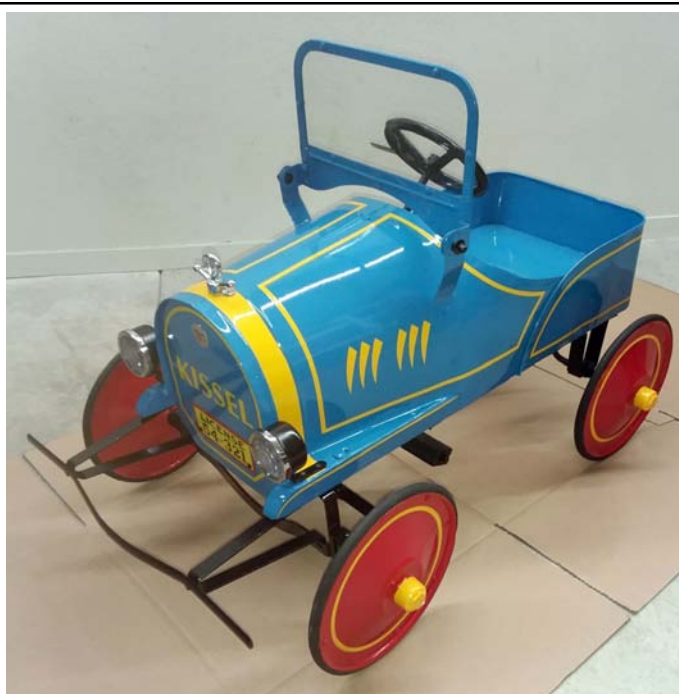
1923 Kissel No.3518D after completing its restoration in January 2020.

cars from this era. I've seen less than a hand full of examples. One of them is scheduled for exhibition at our 2023 meet.