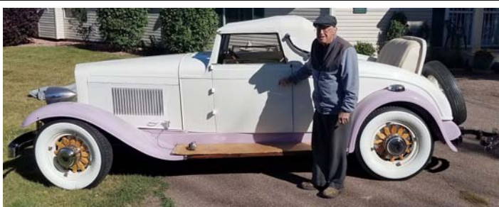
1929 Coupe Roadster (car# 95-1050)