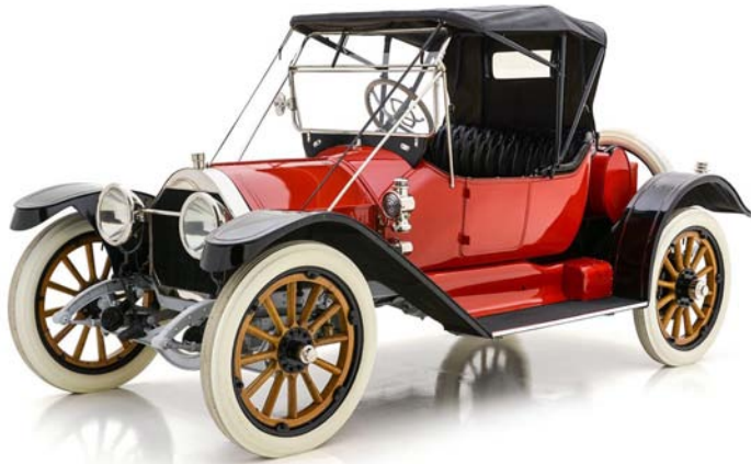
1912 SemiRacer (car# 10103)