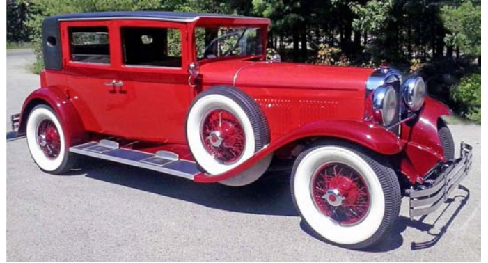
1929 Brougham (car# 126-1064)