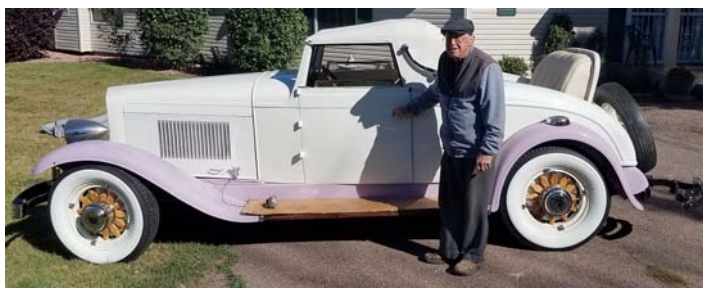
1929 Coupe Roadster (car# 95-1050)